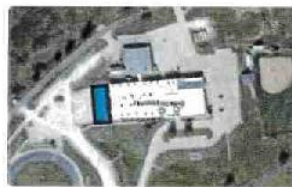
New (West Side) Addition Aerial View