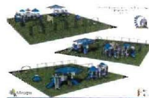
Anticipated Elementary Playground